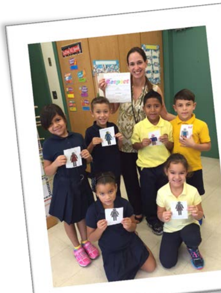
Values Matter at Miami Springs Elementary.