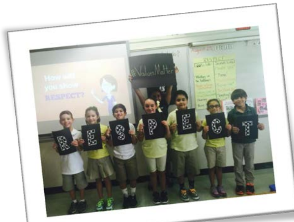
Values Matter at Marjory S. Douglass Elementary.