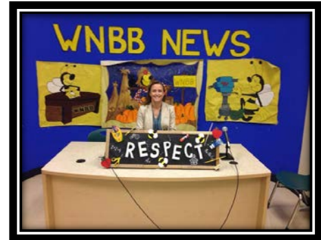
Values Matter at Norma Butler Bossard Elementary.